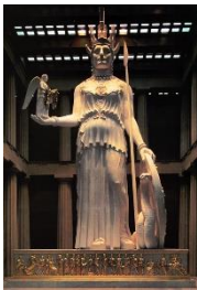
Athena with NIKE

Millions have rubbed and kissed this toe! Athena is also seen with Nike in her hand. When we consider the Scripture that reveals to us, that satan is actually the deity (mighty one) of the sky, the fog begins to clear ( Ephesians 2:2 and 2 Corinthians 4:4 ). Now we have some knowledge that the great 'temple of Zeus' was located here in this beautiful city. Could this be the seat and dwelling place of Satan? Scriptures call this being satan (meaning the adversary), and it is known by many names. For instance, Jupiter, Mithra, Nimrod, Baal, Apollo, Tammuz etc; All meaning the sun-deity.