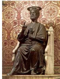
St. Peter / Zeus Statue

During 132-63 B.C., there were three Mithraditic Wars. The main religion during this time was a mysterious cult that grew in popularity around 60 B.C. Roman soldiers practiced Mithraism under-ground. The Mithraism cult became a major rival against the true believers. As Mithraism emerged from secrecy, soon believers in Yahushua found themselves having to hide or compromise their beliefs. Mithraism and the true faith had many similarities. Of course, the only way to tell a counterfeit from the real is to study ( 2 Timothy 2:15 ) (in this case, the written word of Yahuwah) then the fake one will start to emerge its true colors!